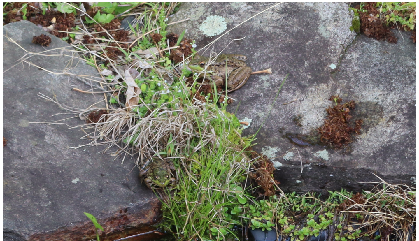
Two hiding in the grass