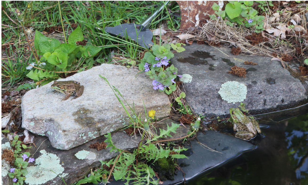
Two on the rocks